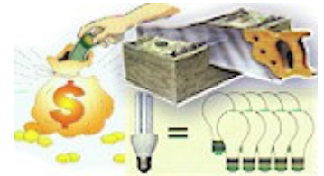
Save Energy = Save Money

DIMLITE bulbs are self ballasted so no changes necessary in existing dimmable lighting fixture. Easy "plug & play" bulb installation, making it a possible for various dimmable lighting fixtures like table lamps in homes, hotels, motels, clubs etc.